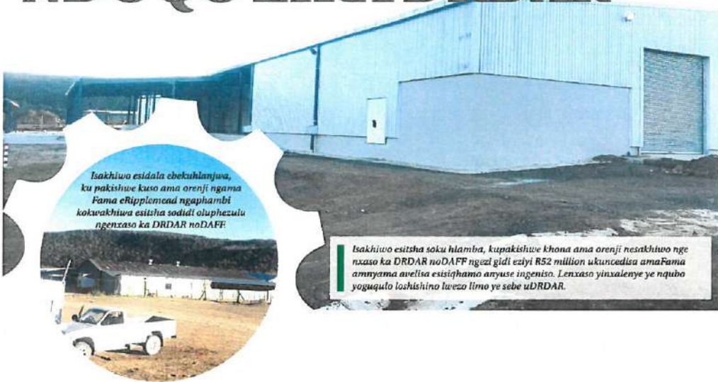
Isakhiwo esidala ebekuhlajwa, ku pakishwe kuso ama orenji ngama Fama eRipplemead ngaphambi kokwakhiwa esitha sodidi oluphezulu ngenxaso ka DRDAR noDAFF