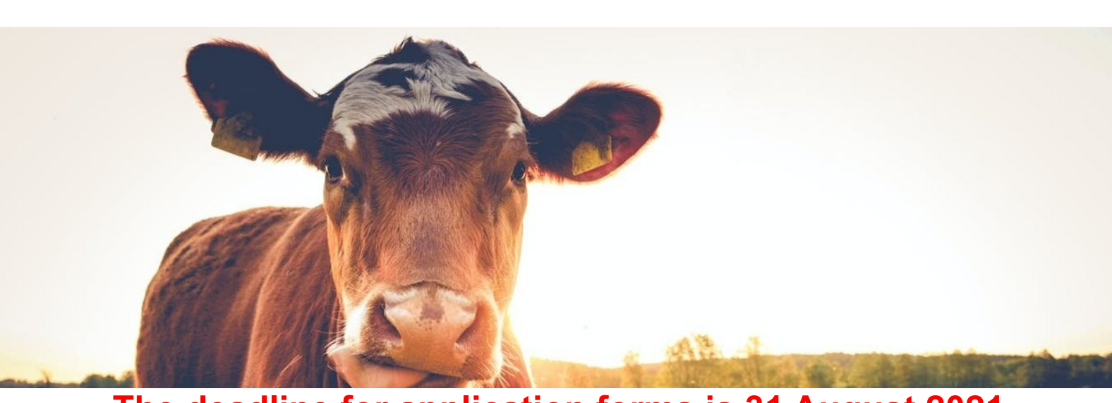
The deadline for application forms is 31 August 2021