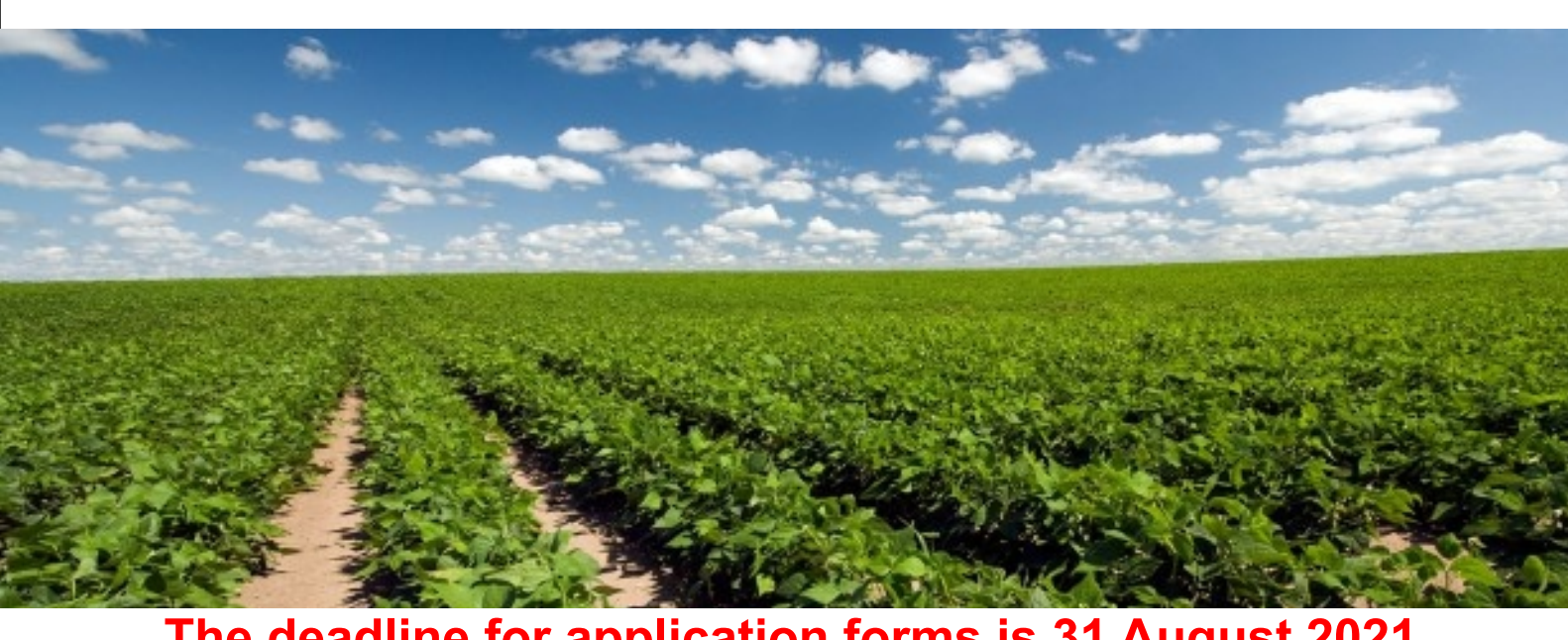
The deadline for application forms is 31 August 2021